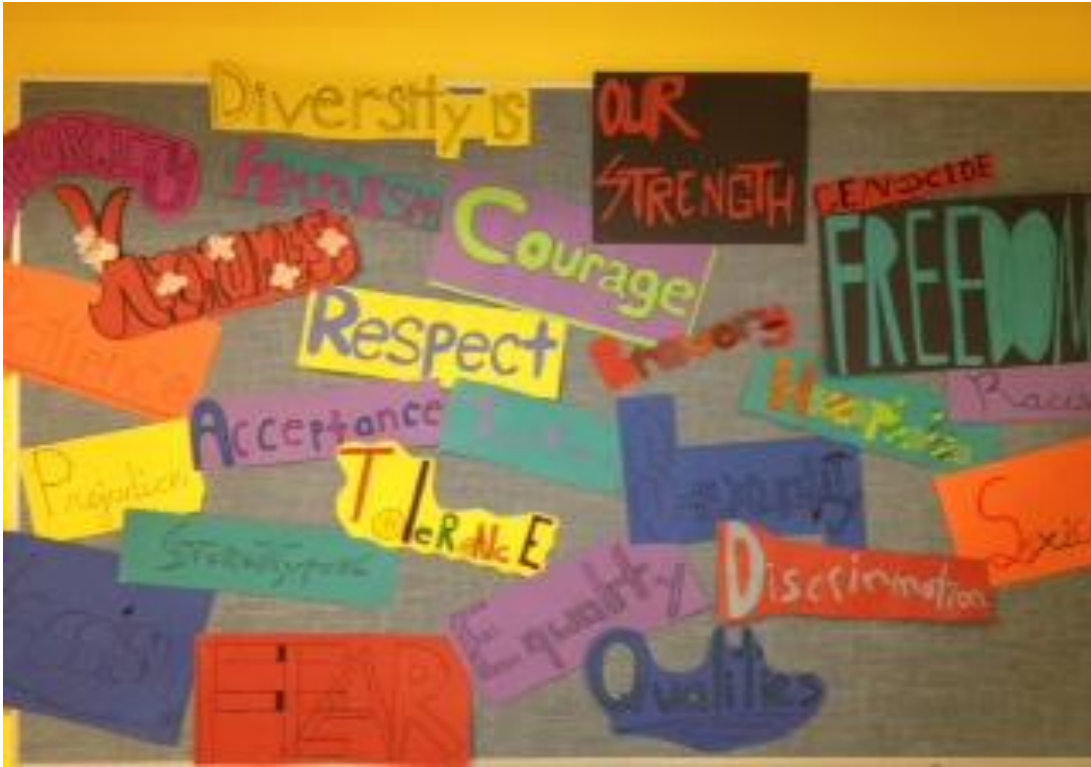
One group of students wrote biographies of righteous gentiles who stood up for human rights and saved lives during the Holocaust. The art work on the book covers is beautiful and moving.